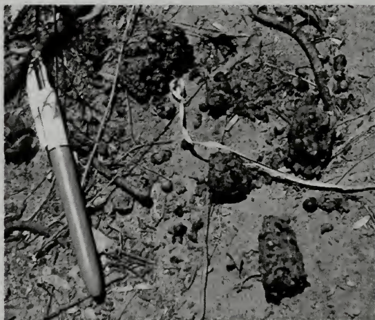
Figure 3. Juniperus osteosperma seeds in coyote scat (near Cottonwood, AZ)

Schupp et al. (1997) examined feces of Nuttall's cottontail rabbits, mule deer, elk and coyotes for the presence of J. occidentalis seeds. Table 3 shows that, in general, these mammals do not consume vast quantities of juniper berries, except for coyotes that have a significant amount of seeds in some scats. We have observed J. osteosperma seeds in coyote scat in Arizona (Fig. 3), where it makes up the major portion of the scat.